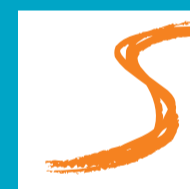
SANDHURST SPORTS CENTRE