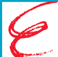
EDGBARROW SPORTS CENTRE